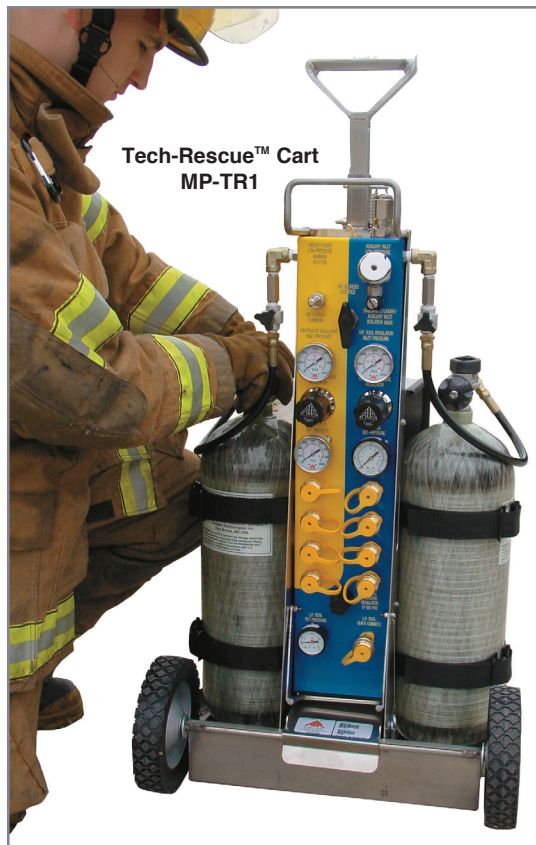
Tech-Rescue™ Cart MP-TR1