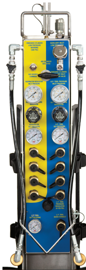
Tech-Rescue™ Control Panel MP-TR1