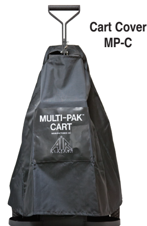
Cart Cover MP-C